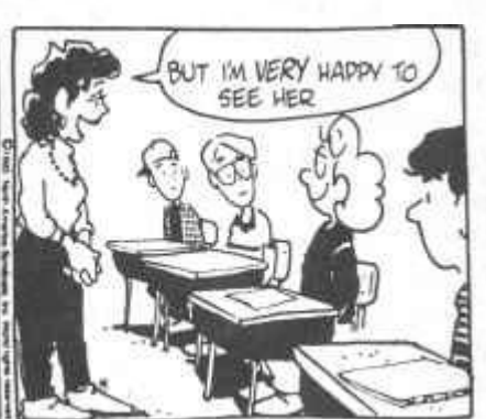
Thanks to the Toronto Syndicate