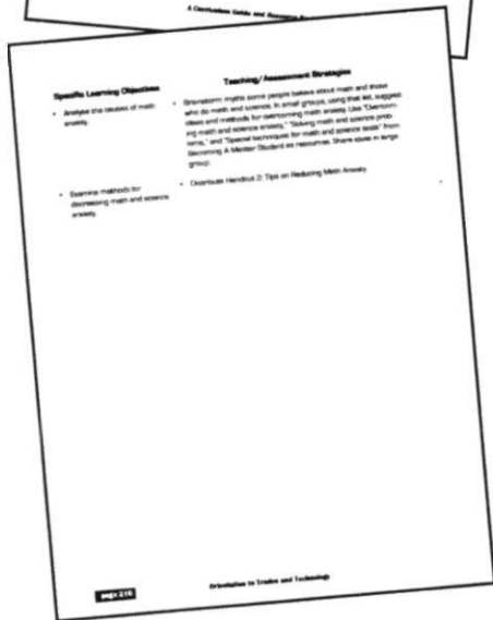
Sample Course Unit Outcomes and Strategies